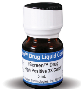
High Positive 3X